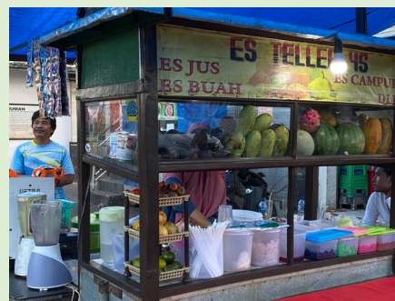
The fruit juice stall at the night market.