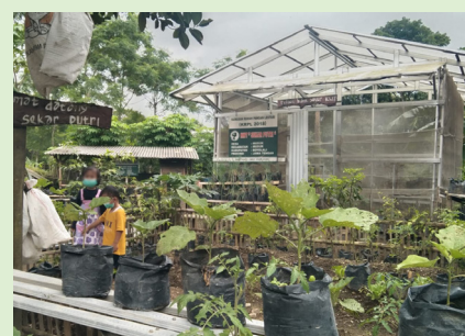
From jungle to vegetable garden!