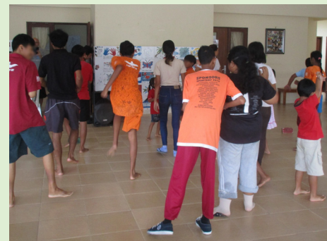
Music and dance hour, Sjaki-Tari-Us.