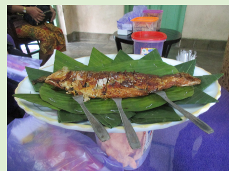
Otak-Otak (fish), Lidia.