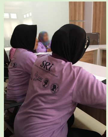
Visiting the Bupati, Kembang Wangi.