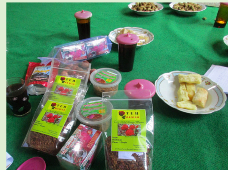
Vegetable fritters, rose petal tea, fried shallots, products of Kembang Wangi.