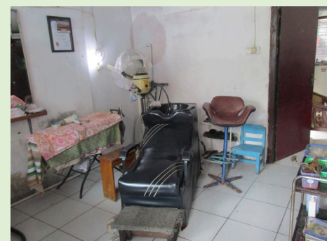
The beauty salon, Lidia.