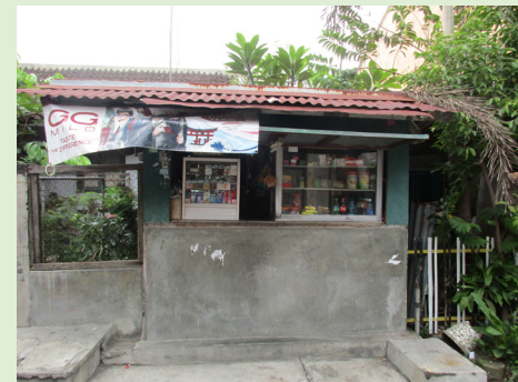
A tiny shop, Lidia.