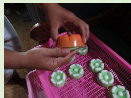
Production of green coconut cakes (putu ayu), Lidia.